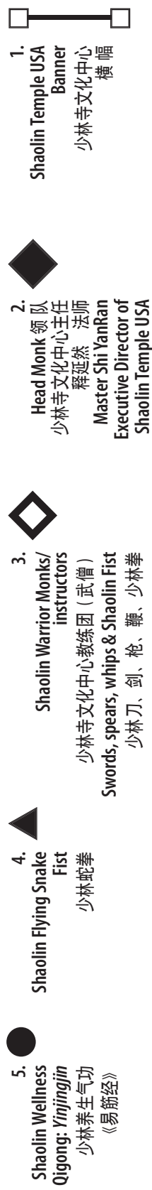
Diagram not to scale • Program details subject to modification 游行方阵可能有所调整.